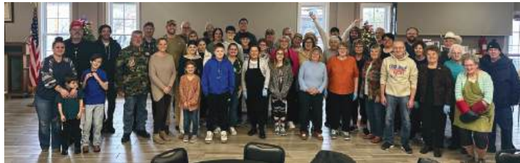
Thanksgiving Dinner Volunteers

Lastly, 2025 is now upon us. Here's to a bright new year and a fond farewell to the old one! Happy New Year!