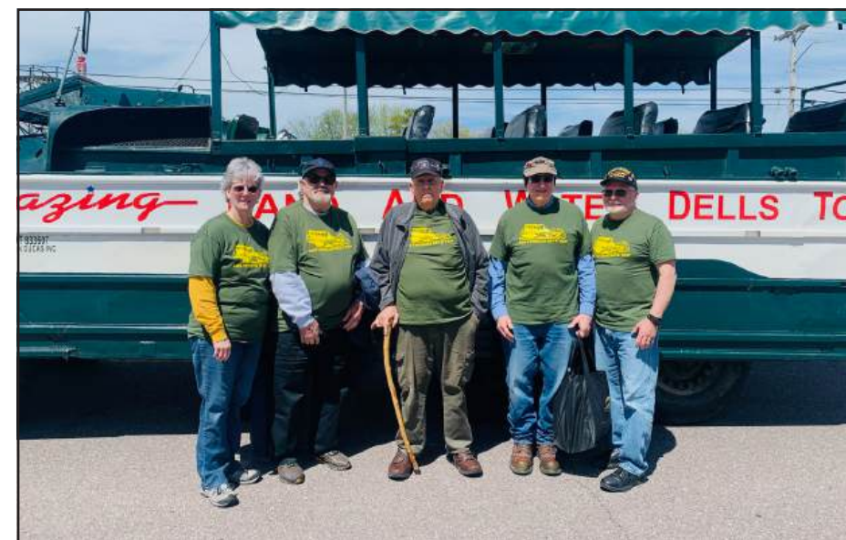
DUCKS ON THE WATER