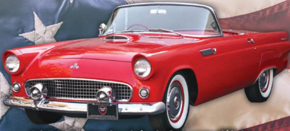
1955 Thunderbird Convertible